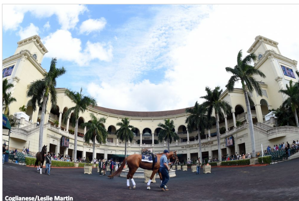
Gulfstream Park paddock

by Paulick Report Staff | 03.24.2020 | 8:27pm