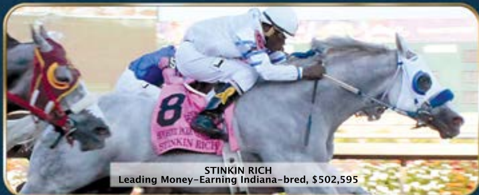
STINKIN RICH Leading Money-Earning Indiana-bred, $502,595