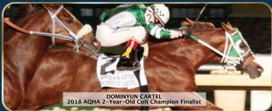
DOMINYUN CARTEL 2018 AQHA 2-Year-Old Colt Champion Finalist